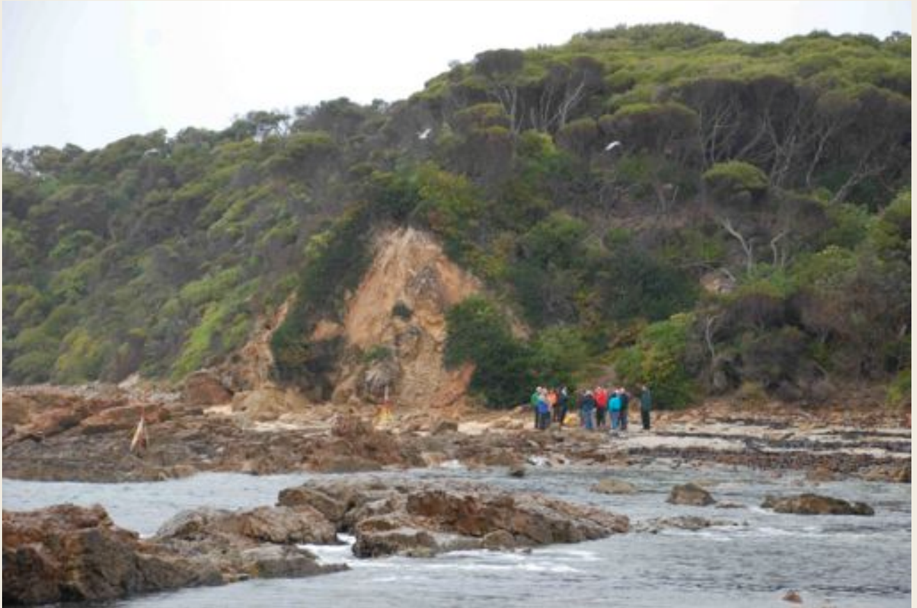
Panel and representatives inspect breakwater site where the raised beach road will meet the breakwater

The Panel sat for 14 days and heard from approximately 70 submitters and 13 expert witnesses.