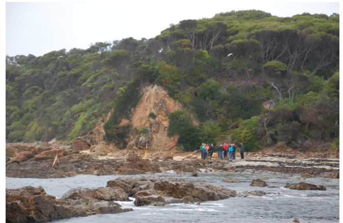
Photo: Panel and representatives view breakwater site.

Markers had been placed to indicate the height, location and length of the proposed breakwater, and both commercial and recreational boat operators gave demonstrations of boat launch and retrieval procedures.