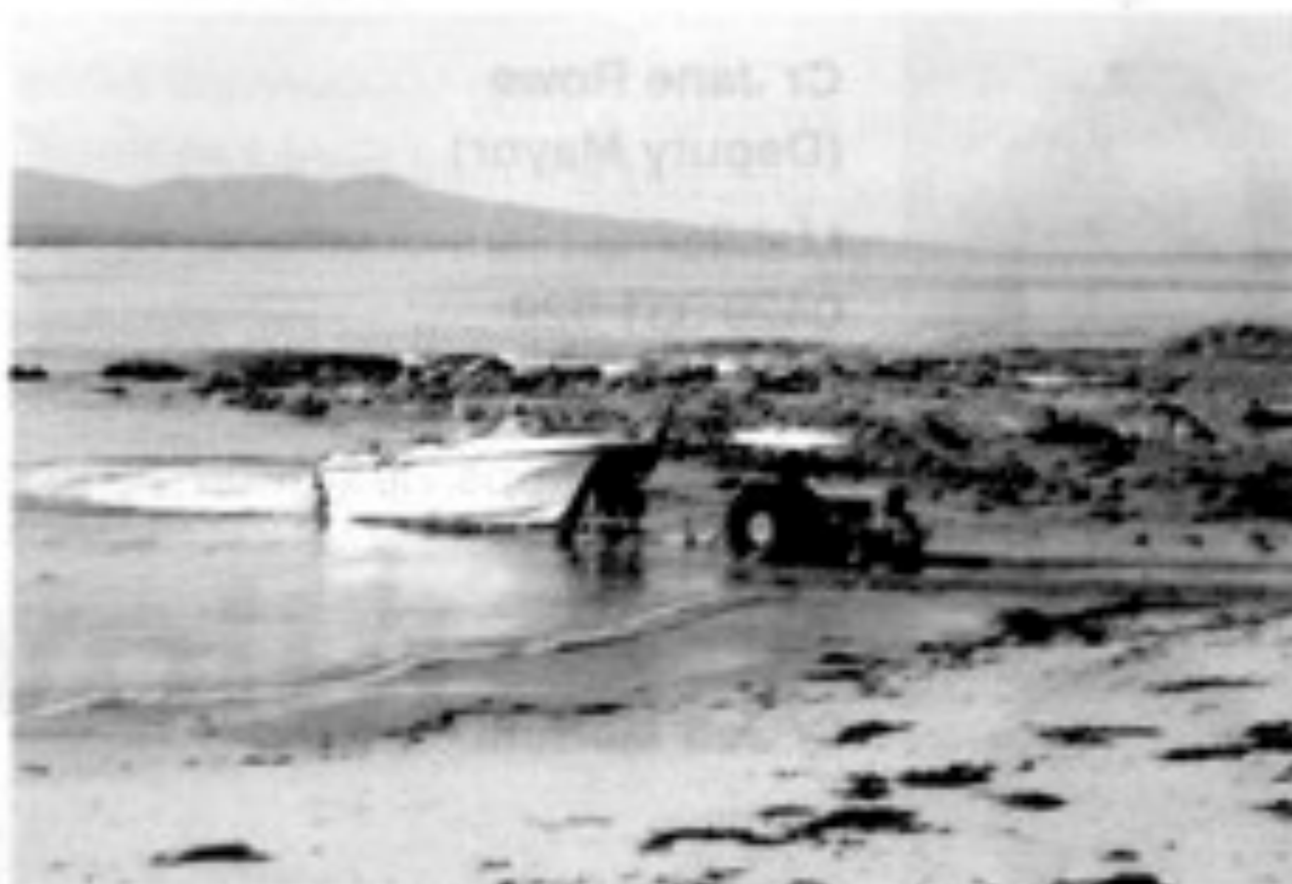
The existing ramp is of poor quality, unsafe and provides a poor level of service.

The consent under the Coastal Management Act, together with a funding commitment by the State Government, now means that Council can proceed with preparation of tender documentation for construction of its preferred model, known as Option 3B.