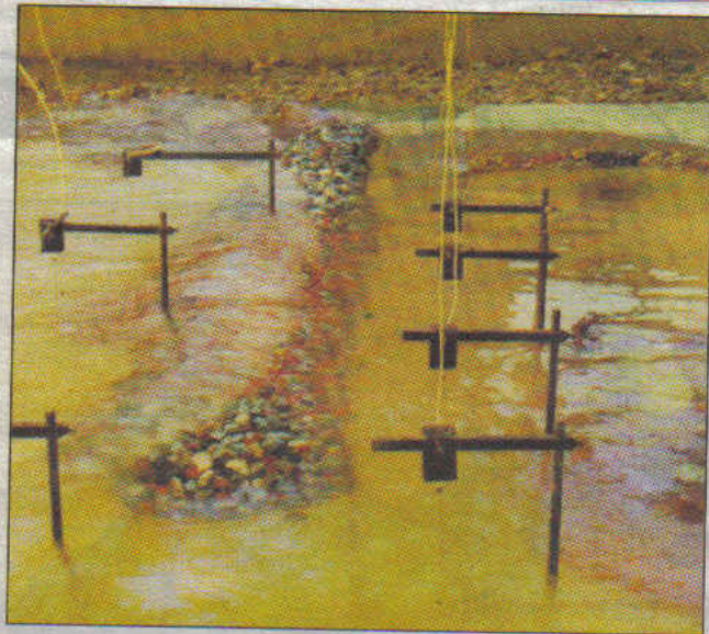
Waves striking the breakwater in the simulated one-in-100-year weather event. (PS)